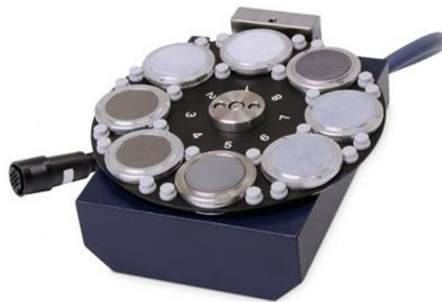
Figure 1: Miniflex 8-Sample Holder