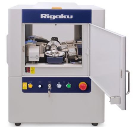
Figure 2: Miniflex XRD Instrument